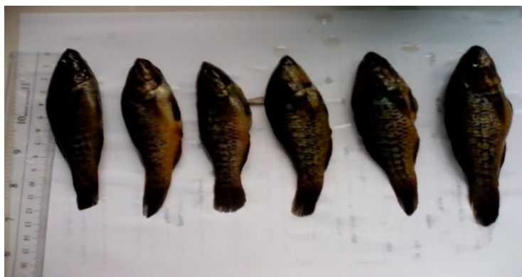
Figure 1. Hypseleotris agilis , Herre

Freshly caught H. agilis fish samples from Lake Lanao were collected from Marawi City public market. The body weights ranged from 23-25g and body lengths from 11-13cm (Figure 1). Five individual fish samples (130g), were washed with distilled water (DW), cut into sections and soaked in 100mL 90% methanol for two days. The methanol extract was then filtered and concentrated under vacuum in a rotary evaporator at 40°C and 115rpm. The crude methanol extract was assayed for antimicrobial activities using filter paper disc diffusion method.