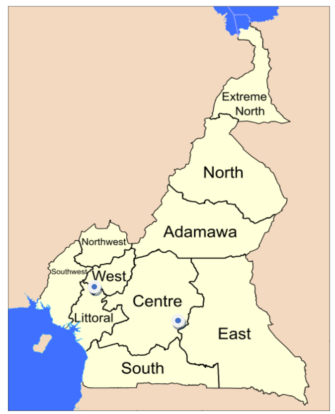
Figure 1.1 - Map of Cameroon showing the 10 administrative regions

Secondary schools across the country follow the same curriculum and students take the same national examinations; consideration was given to balancing the one Anglophone region (English is the predominant language) and the other from the Francophone region (French is the predominant language). Selection of the research sites for this study was challenging, as there are ten geographical regions in Cameroon as shown on the map with; eight being French speaking while two are English speaking. For this reason, a multistage approach was used to select two regions out of the ten in order minimise the cost and resources of surveying samples from all regions (Scott and Morrison, 2007 and Cohen et al., 2007). A purposive sampling of 202 form five students (usually 15-16-year-old) and 26 teachers was done and questionnaires were administered. The choice of form five students was found appropriate since at this stage of their education, it is expected that they have experienced the curriculum and are about to leave school. Teachers were sampled because I assumed that they understand the curriculum they are responsible for delivering. Cohen et al., (2007) suggest that there is no clear-cut answer to the issue of correct sample size since it depends on the objectives of the study as well as the population under examination. The selected sample was for this study was considered adequate.